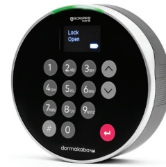
Model 705 Multi-user, 5-lock system, display